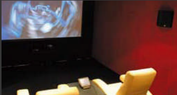
DecoFrame is also the first choice for your home cinema.