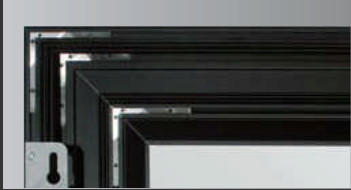
The connecting angles are attached by screws and guarantee a highly accurate corner joint.