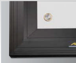
The projection material for the perfect home movie sound is micro-perforated and thus permeable to sound.