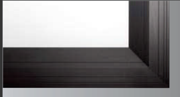
Sharp corners ensure accurate borders around the area of the projected image.