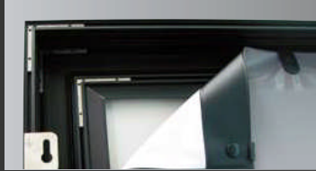
During assembly the screen material is attached to the frame.