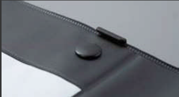
The screen material is attached to plastic hooks.